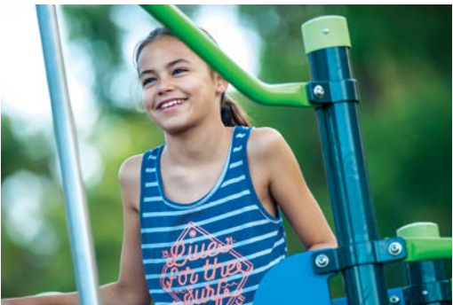
Covella is an active8 community.